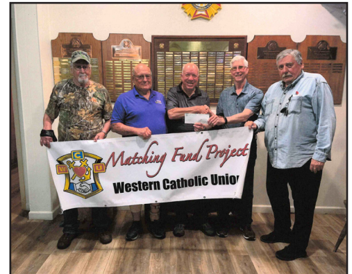
Ste. Genevieve, MO - Check presentation for VFW Dinner Dance to restore WWI Cannon