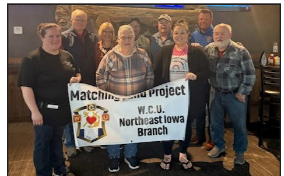
Nashua, IA - WCU's newest branch in Northeast Iowa held their first meeting in March