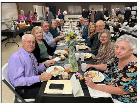
Jefferson City, MO - Breakfast for St. Thomas Church Ladies Auxiliary