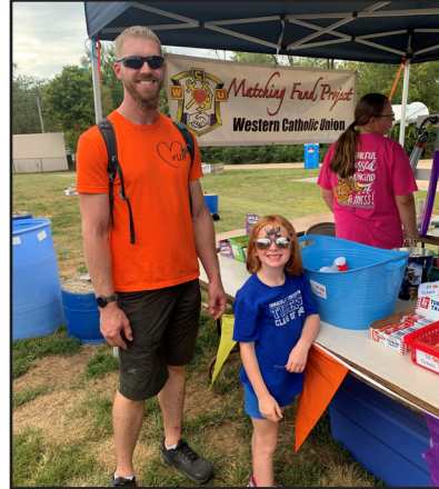
Union, MO - Children's Games at Immaculate Conception Parish Picnic