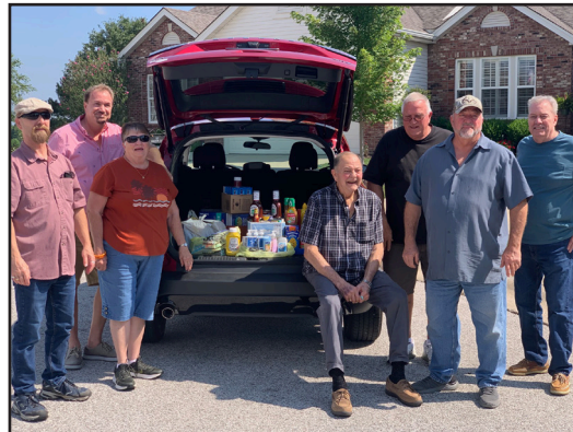
Caseyville, IL - Donation of food items to Caseyville Food Pantry