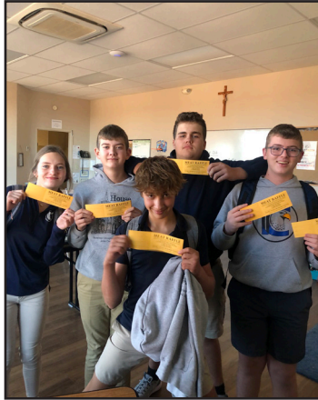
Linn, MO - Meat Raffle for Immaculate Conception School