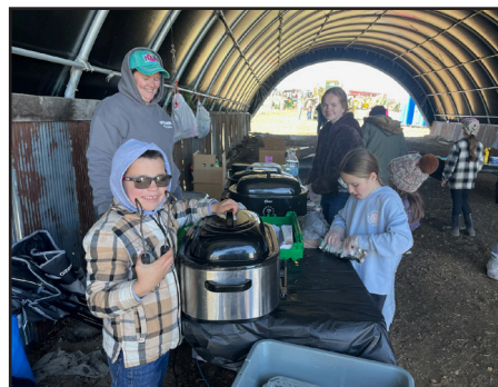
Westphalia, MO - Food Stand for Folk Lucky Clovers 4H Club