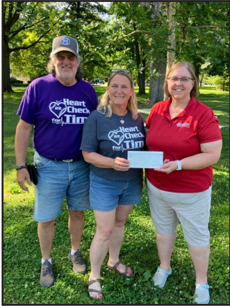
Quincy, IL - Heart Check for Tim Check Presentation

In 2024, our branches invested over 20,000 hours on community service events and helped raise over $719,000 for your neighbors! In addition, WCU provided over $32,000 in matching funds. We are proud to be able to assist our members in helping those in need for the past 148 years.