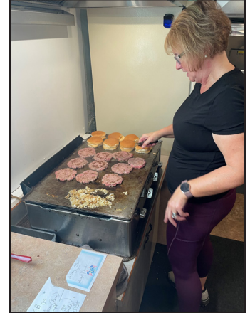
Clover Bottom, MO - Burger Day