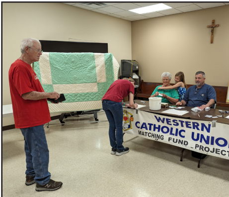
Apple Creek, MO - Quilt Raffle at St. Maurus Parish Breakfast